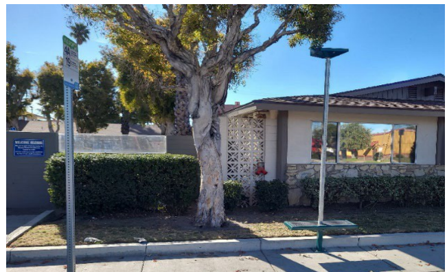
Bench and Solar Lighting installed at Gonzales Road & Ventura Road bus stop.

The Clean CA Program facilitates collaboration between Caltrans districts and local agencies to develop and implement transit partnership projects to address demand, usage, and ridership in a strategic and impactful manner that align with the goals and priorities of the program.